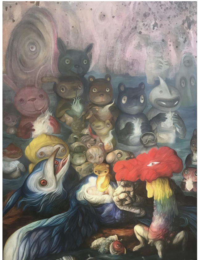
Froilan Calayag, Heartburn , 72”x48” Oil on Canvas ©Froilan Calayag